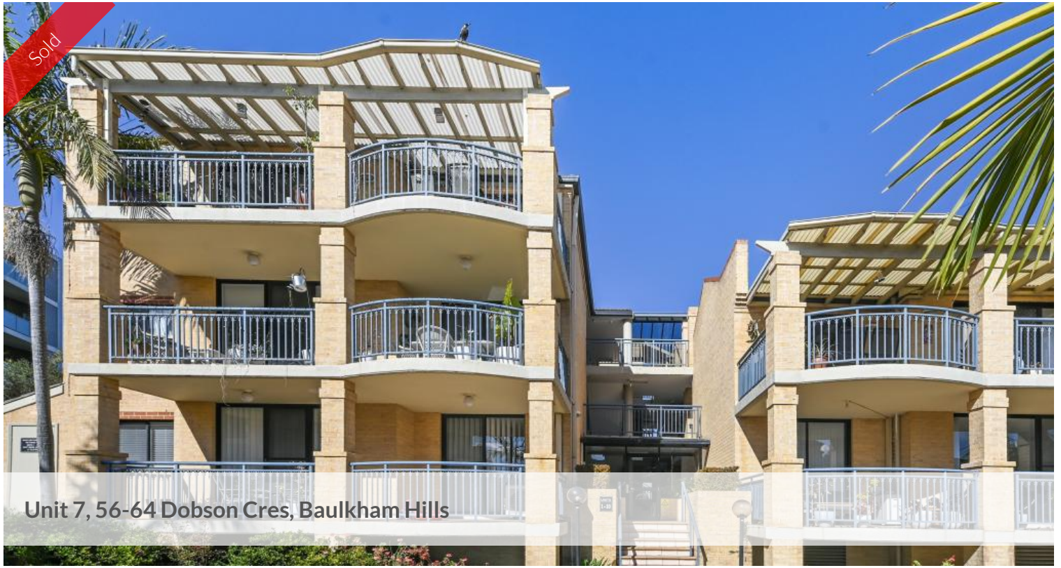
Unit 7, 56-64 Dobson Cres, Baulkham Hills