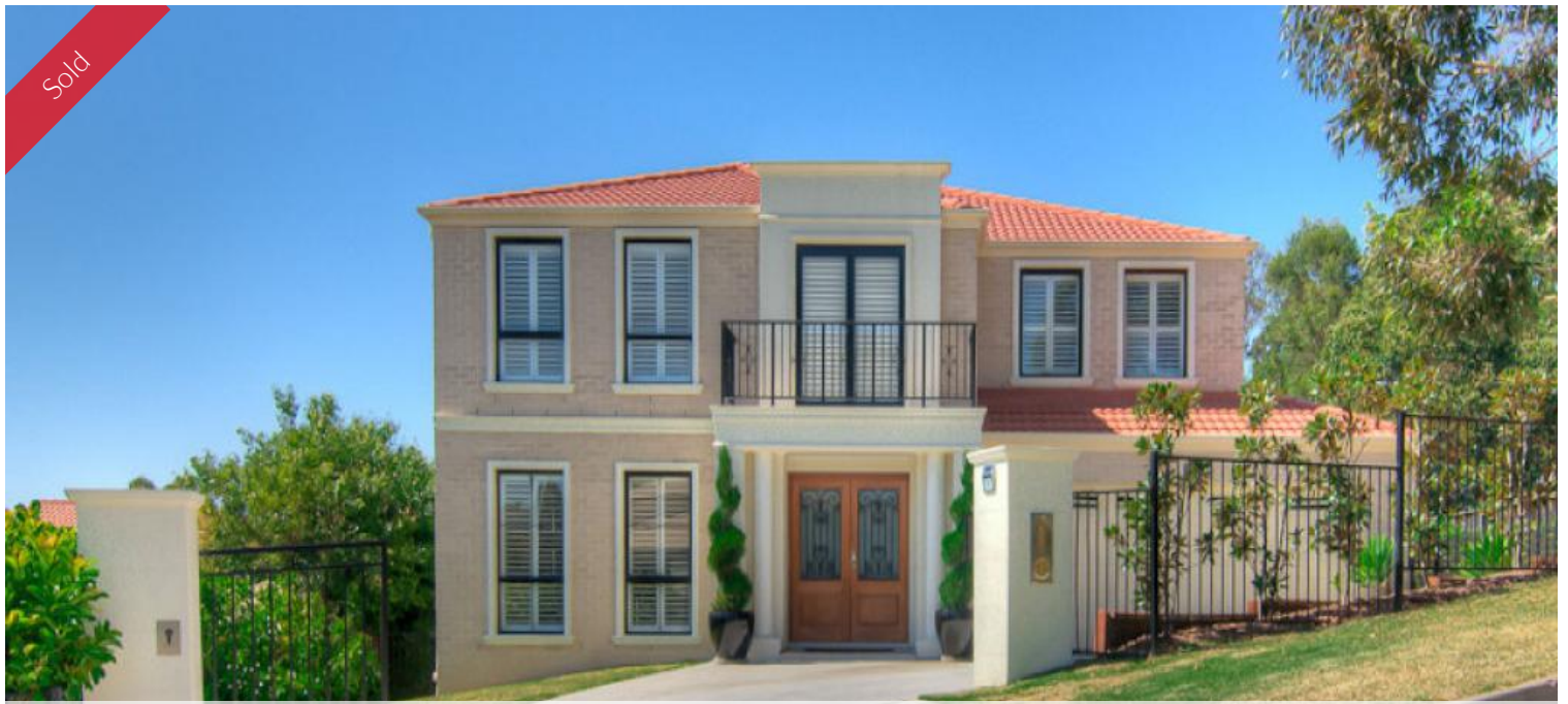
1 Armidale Crescent, Castle Hill